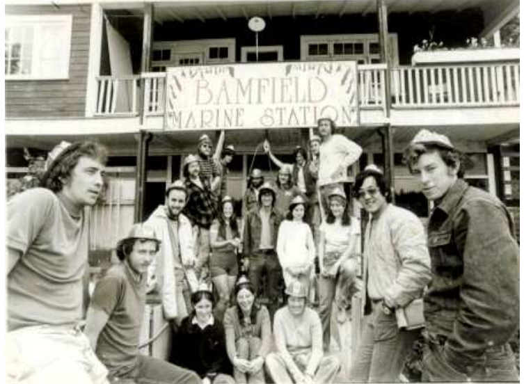
Bamfield Marine Station students, staff, and faculty celebrate Fire Daze (note silly hats) in 1972 at BC Packers where the first courses were offered. Photo Bill Austin ( www.bamfielder.ca for names of those above.)

BAMFIELD MARINE SCIENCES CENTRE, THANK YOU FOR 40 YEARS OF GREAT MARINE SCIENCE & INSTRUCTION & SOCIAL INTERACTION!!