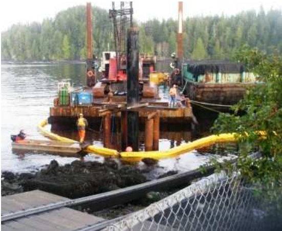
The first of several pilings in support of the CCG breakwater float.

Old Base Doomed. Work continues at the Coast Guard Station with a new breakwater float being built for RHIOT on the north side of the property. Hopefully, this skookum float will protect the government and General Store floats. Tenders are out for the new Operations Building with demolition/ construction scheduled to start in the Spring. If any locals would like to walk through the old base before it goes down, give us a call (250-728-3322) and drop by. Clay Evans