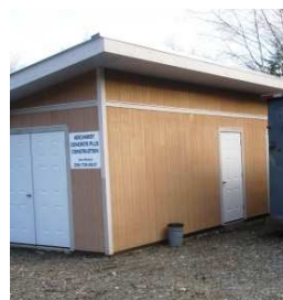
Recycle Depot

Dear Bamfielders , four years ago Bamfield got a waste/recycling station. Since then many improvements have been made, and we can enjoy a functional, user friendly transfer station. These include: extending the ramp, several modifications to the garbage bins, signage, and of course the New Re-use Shed . We requested Raynor and Bracht to make modifications to the garbage bins to make them more user-friendly. Please take note of the long horizontal bar which closes all lids at once when done. The control arm is on the side of the bin as you approach it. There are also individual bars to prop up each lid separately. The recycling bins can be accessed from both sides and since we have more cardboard than paper in our community, feel free to put cardboard and paper together. Please take note of all SIGNS that are posted. We appreciate your co-operation. Call us if you have any questions. Suzanne Rompre , Waste/Recycling Contractor, 250-728-3363