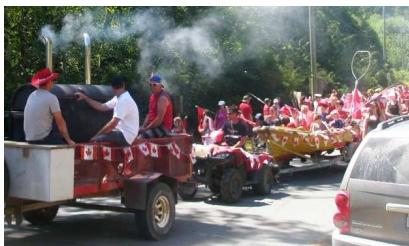
Photo: The Pig-of-honour ... leads (after the BVFD fire truck) Bamfield's July 1st parade, followed by Seabeam's colourful float, ...to be enjoyed by all!