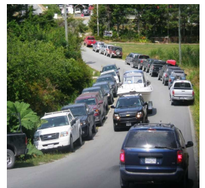
Long weekend Bamfield parking is a problem.