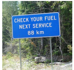
Not really, 5 km to Anacla Gas Bar.