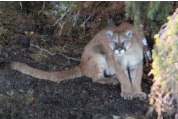
Cougar at The Wall watching Paul and Steve Demontigny fish.

Road Safety. Twenty-nine Bamfielder/Arifacla folks attended the 2019 Bamfield Road Safety Committee's AGM (last year, 3). Bamfield Main, while its length is divided by various parties, is an industrial road. The public is welcomed to use this road, but they must submit to logging traffic. Due to 'soft shoulders' logging trucks do not have the option of pulling over. Western Forest Products is supportive of upgrading the road, even though they may need to discontinue using the over-sized trucks. Road-use statistics showed a marked increase this year over last year (190K trips in 2018 vs 220K trips in the first 8 months of 2019). The BRSC directors were returned to office, with no new volunteers. This is surprising, considering the passion of those attending. Thanks were offered to Stefan Ochman , the directors and the attending industry and government advisors. L. Druehl