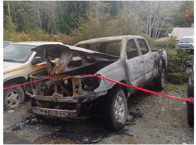
Bamfielder's truck in front of motel burned out. Arson? Accident?