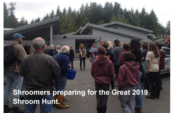
Shroomers preparing for the Great 2019 Shroom Hunt.