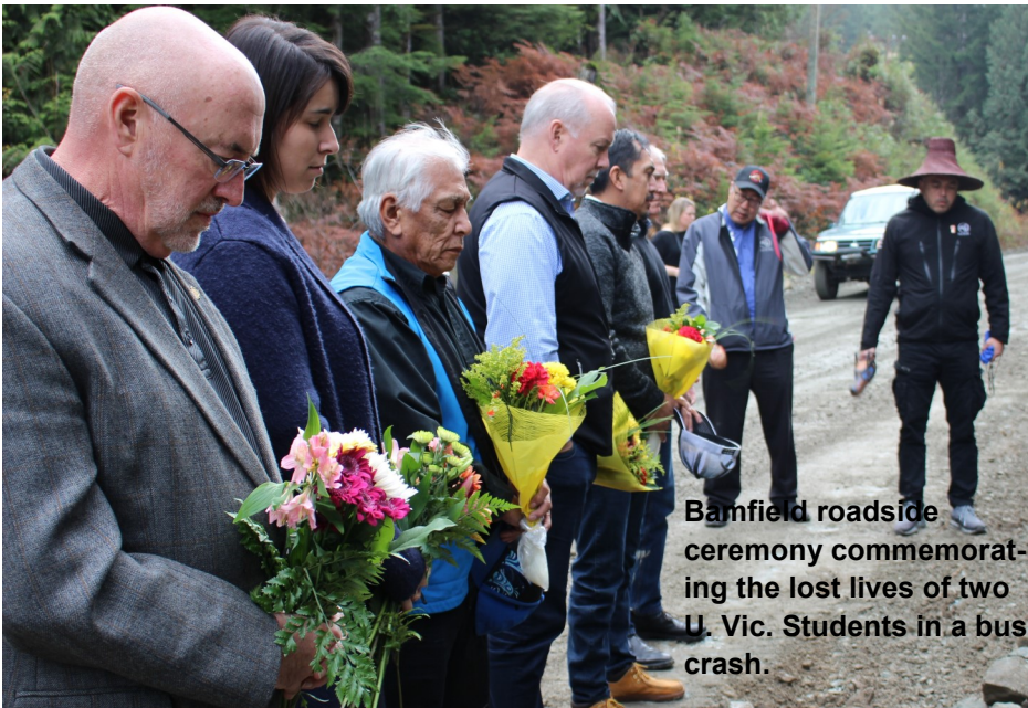
Bamfield roadside ceremony commemorating the lost lives of two U. Vic. Students in a bus crash.