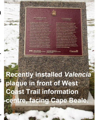
Recently installed Valencia plaque in front of West Coast Trail information centre, facing Cape Beale.