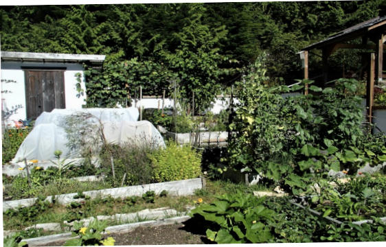
A flourishing community garden. Andre a's fig tree 4 years away from a Fig Newton, Rae 's pet squash, her veggie baby, stolen and the 'wild strawberries running free.