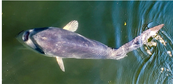
3-foot sun fish stops off at Tishes , "I'm supposed to be in school. But I heard this is where the action is."