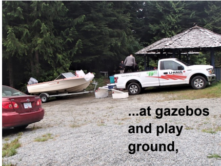
...at gazebos and play ground,