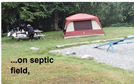
...on septic field,