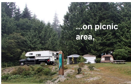
...on picnic area,