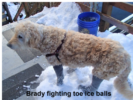
Brady fighting toe ice balls