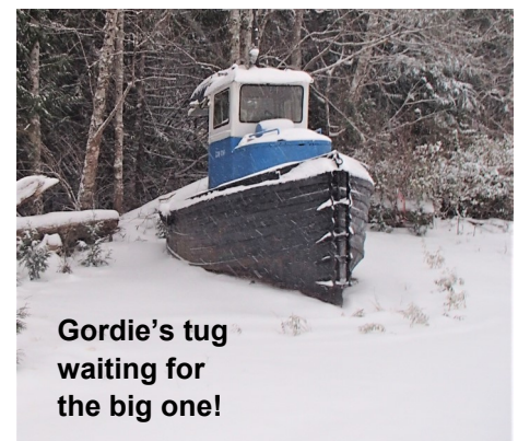
Gordie's tug waiting for the big one!