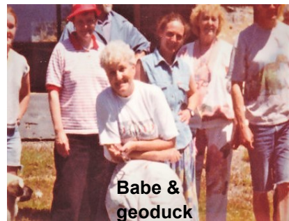
Babe & geoduck