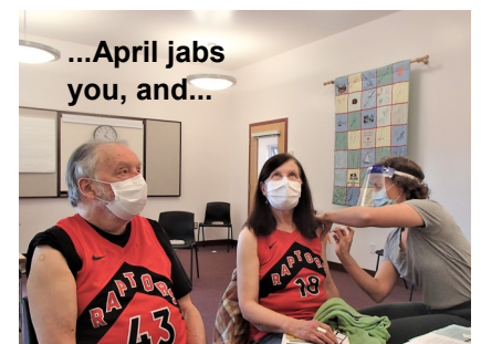
...April jobs you, and...