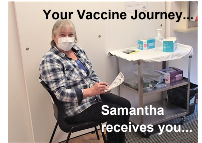
Your Vaccine Journey...