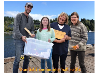
Bamfield community hall rally