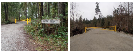
Gated Park Canada & HFN Camp Site stymie seniors' Pachena Beach access.