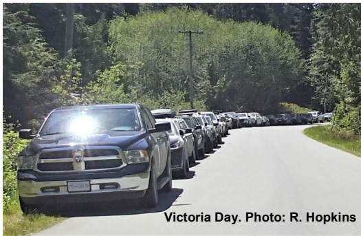
Victoria Day.

Parking issue solved. Visitors and guests to the west side have solved the east side's parking problem: Ditch Parking!!!