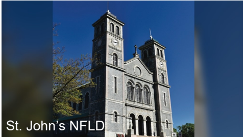
St. John's NFLD