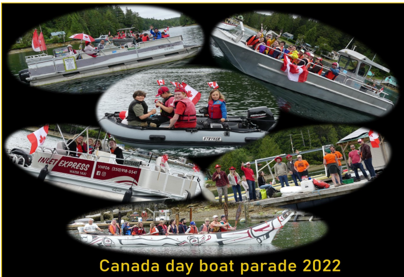
Canada day boat parade 2022