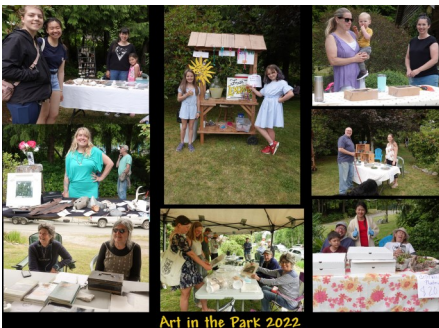
Art in the Park 2022

The first Bamfield Marine Station. In the late 1960s I approached the Bamfield Post office to establish a mailbox for the Bamfield Marine Station.