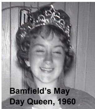
Bamfield's May Day Queen, 1960