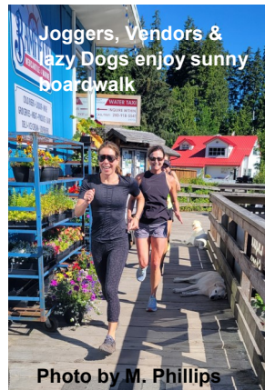
Joggers, Vendors & lazy Dogs enjoy sunny boardwalk