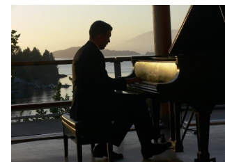
Piano solo, 2017