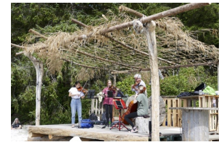
Brady Beach COVID, 2021