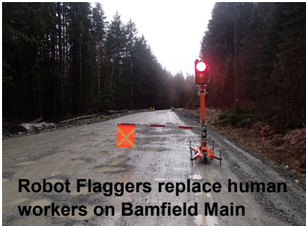
Robot Flaggers replace human workers on Bamfield Main