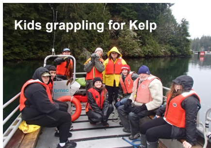
Kids grappling for Kelp