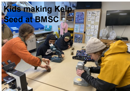
Kids making Kelp Seed at BMSC