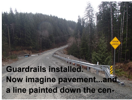
Guardrails installed. Now imagine pavement...and a line painted down the cen-