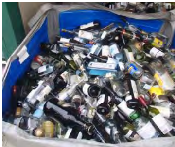
Bamfield Treasure. School bottle drive Bonanza? Bins of 'dimes' that were paid to merchants and now lost, or a school fieldtrip?.