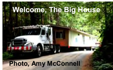
Welcome, The Big House