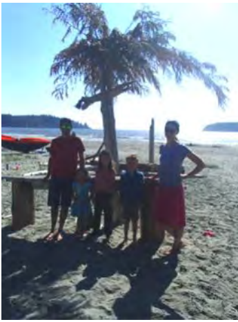
Reality Check. The Hyslop family from Canberra, Australia seek shade under a Pachena Beach palm tree.