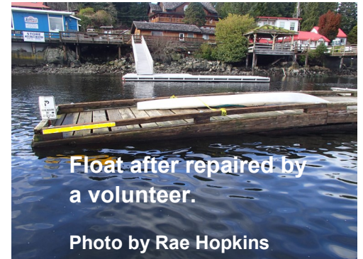
Float after repaired by a volunteer.

According to Roger Démonigny's interview with the driver, she handled well at 130 km/hr and her trip here is probably longer than the mileage she'll get before being aged out.