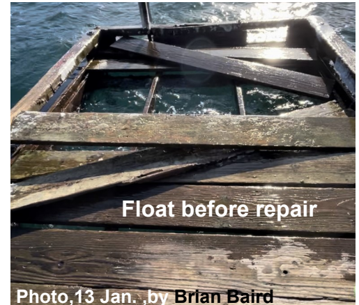
Float before repair

Who is in charge of our essential Government wharf?